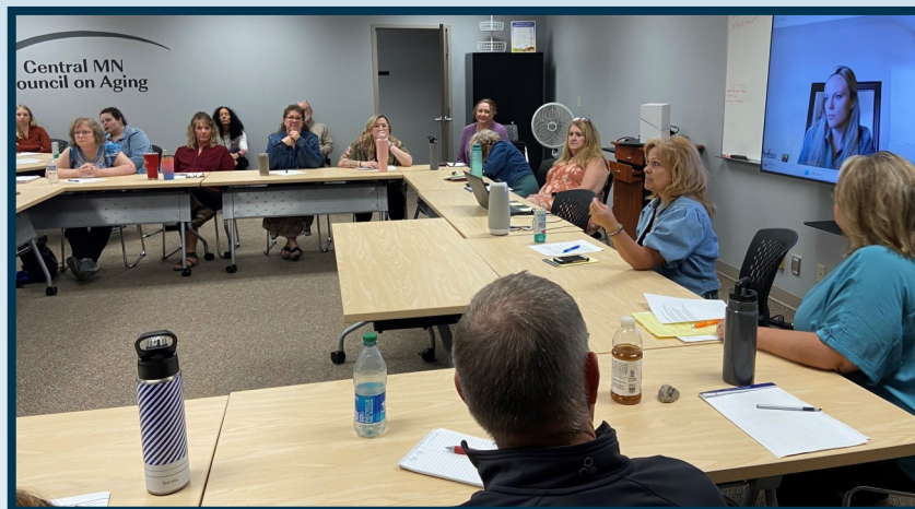
CMCOA staff meeting, June 2024

This annual report celebrates our 40-year journey and the achievements of the past year. We could not have accomplished this without your support and collaboration. Thank you for your commitment. Together we can make a lasting difference in Central Minnesota.