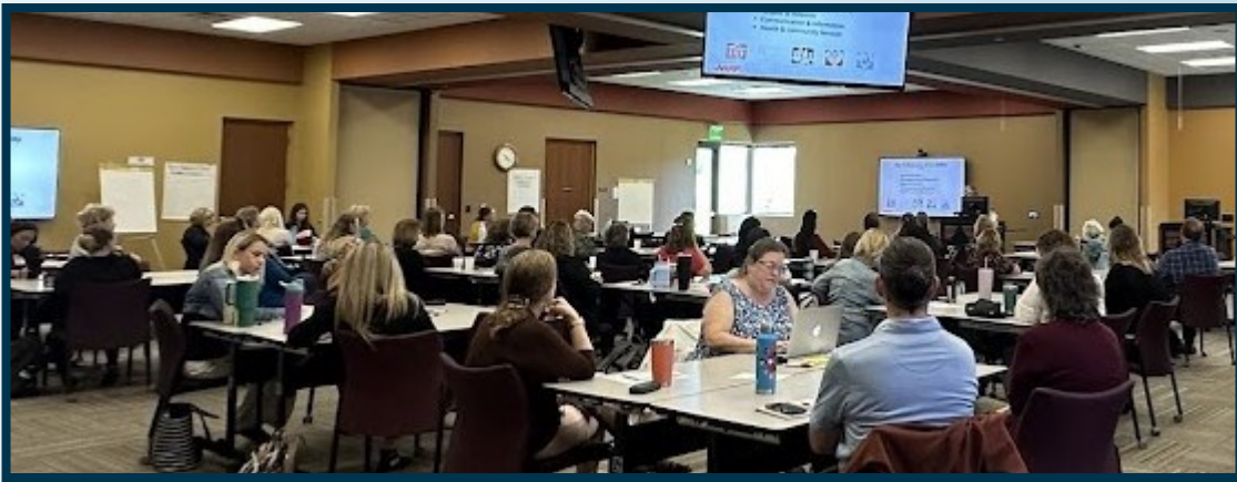
Powered By Connections event, May 2024, in Sartell, MN.